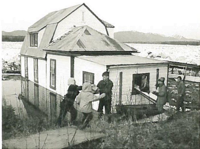
Rescuing objects from the Customs House, Eagle.

Volume 37, No. 2 Quarterly of the Alaska Historical Society Summer 2009