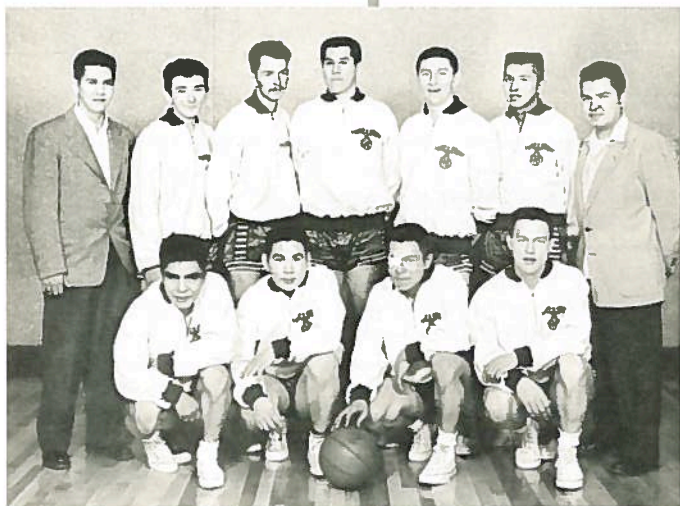
Gold Medal championship ANB basketball team, 1956.

Until quite recent times the king of organized school sports all across Alaska was basketball. It requires a small number of players so is perfect for a small school, uses an enclosed court which means it can be played year-round, and is fast-moving so entertaining to watch. The Juneau-Douglas City Museum is featuring the game in Juneau and area this summer. This year will also see the 63 rd annual Lions Club Gold Medal Basketball Tournament. This tournament did more to fight racism in Southeast Alaska than any other one thing. All the towns around sent teams; their very best players. It did not matter if they were native or white; the crowds came to Juneau in March to see and cheer their favorites. As the years went on, it became a social event where families and players mingled and reminisced.