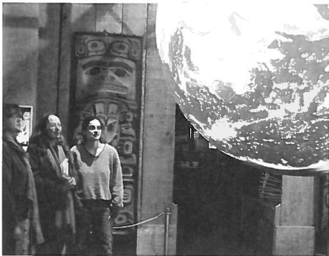
Science on a Sphere at the Alaska State Museum.

museums and historical societies. [See related article on Eagle.] And the museum received a three-year $163,275 federal grant for 18 interns to work in Alaska museums and historical societies. Your state museum at work, helping the small places become and remain professional.