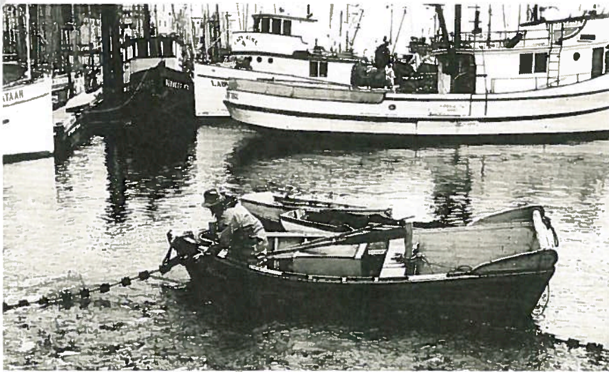
Herring seining at the City Float, Ketchikan, 1955.

Ketchikan has a local resource many societies would envy; a huge collection of professional photographs taken from 1950 to 1982. From the thousands of pictures the Tongass Historical Museum has put on three different exhibitions, all highly successful. The latest, "plus fifty..." was another smash hit with locals crowding in to see grandparents, friends, and even themselves in the Ketchikan of the 1950s.