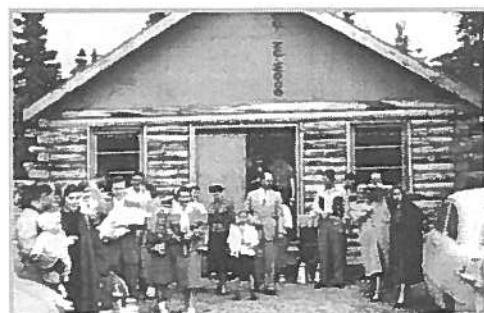
The first Roman Catholic Church in Kenai, a log structure finished in 1954, has been completely renovated.

Buildings, buildings, have kept the Kenai Historical Society occupied <heh, heh; little irresistible joke there> for some time. The history of the current home of the Peninsula Oilers' Baseball Club and a bingo hall, from its construction in 1957 as a retail space, has been documented, complete with photographs; the hospital is slated for a major expansion; and the first little Roman Catholic church, a log structure finished in 1954 but soon outgrown, has been completely renovated.