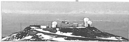
Nike Site Summit.