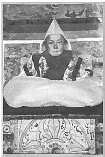
Oil painting of the young Dalai Lama from Tiber: Mountains and Valleys, Castles and Tents at the Anchorage Museum of History and Art.