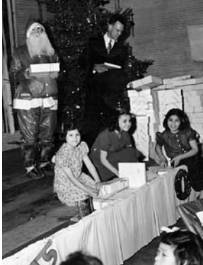
Eklutna Christmas party.