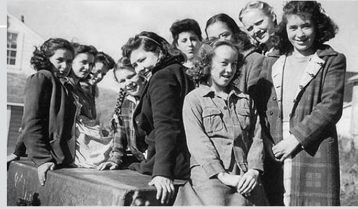
School girls of Unga, ca. 1946 from The Alaska Pen .