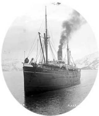
The steamer Oregon at Valdez.