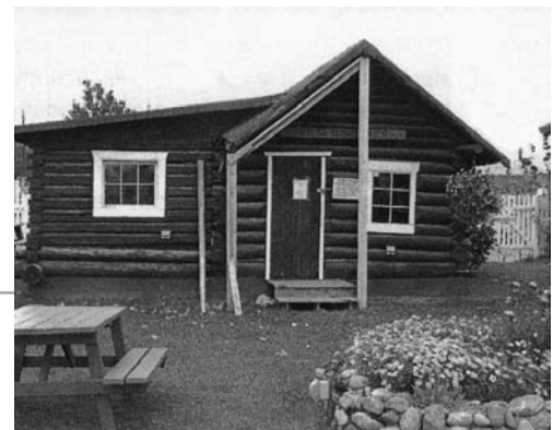
The Walter Trench Cabin in Wasilla is getting a new roof and other structural improvements funded by the City of Wasilla. (See front page for story.)

This is not just a tip for researchers, it's also a lead-in to an anecdote. One day at lunch I met a pleasant couple from Stansted. They were compiling as much information as possible on the history of their community, under threat from airport expansion plans. The idea was to make the town aware of the value of keeping its old buildings, fields, and general ambiance. We agreed that people today seem to feel modern is good, and progress even better. As the wife said, "People travel thousands of miles to see where their ancestors lived. Wouldn't it be sad if there's nothing left today?" Far too many Alaskans like to point out that Alaska is a young state. So it is, in terms of the rest of the United States, but 1959 is ancient history to anyone under 40. Last year I was asked during my lecture on Alaska history to