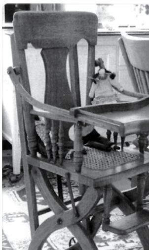
Antique high chair first used by Kodiak children in the early 1900s.