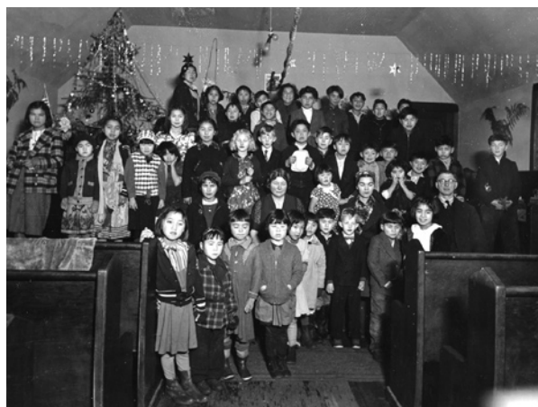
(above) Children's christmas program at the church in Yakutat.

Alaska State Library Historical Collections, Flhoki Kayamori Collection, ASL-P55-634.