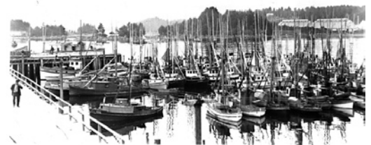
Trollers tied up in Sitka, mid 1920s. Japanski Island government coaling buildings in background.

There's something fascinating about old houses. Large, small, or in-between, they invariably rouse the imagination concerning former inhabitants. The Sitka Historical Society newsletter contains information on the history of the "Sunburst" house and its various owners, which included some of the leading merchants of the town. Its lot had nine sides and a 12-foot frontage, but no one explained why the stylized sun was painted on the front of the house.