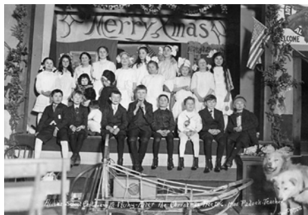
Alaska school children perform in the Christmas Tree , 1916 in Ruby.