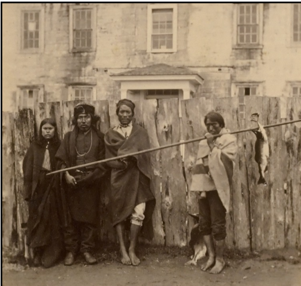
Members of the Kiksadi Tlingit community of Sitka, 1868. One man has a salmon on a spear and more on a stringer. Bancroft Library, Eadweard Muybridge Photographs (1971.55: 479).