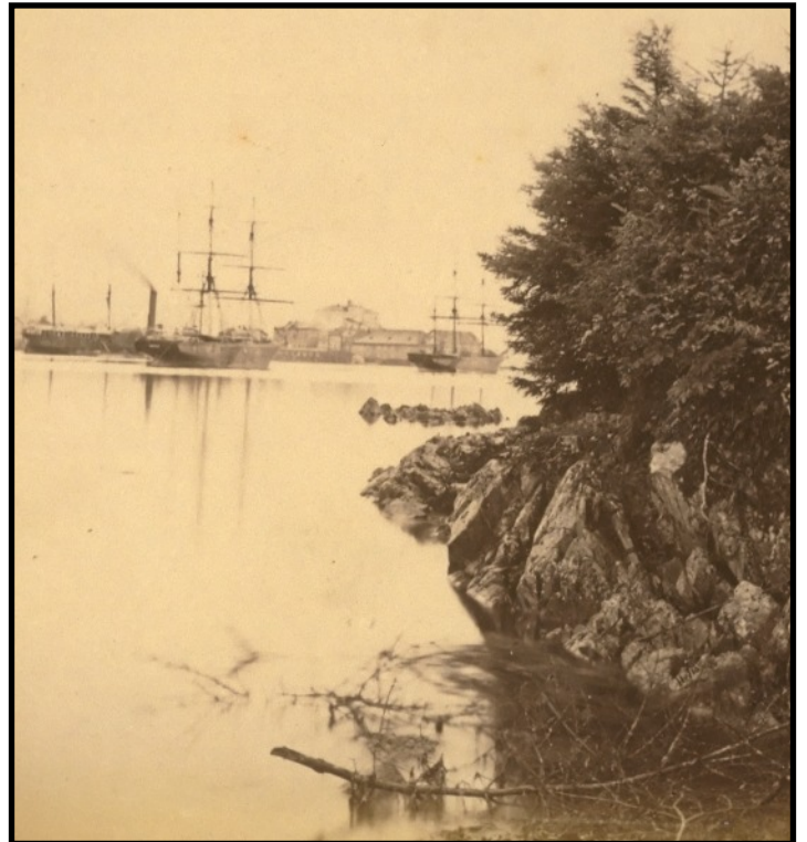
View from Japonski Island of ships at Sitka with Castle Hill in background, 1868.