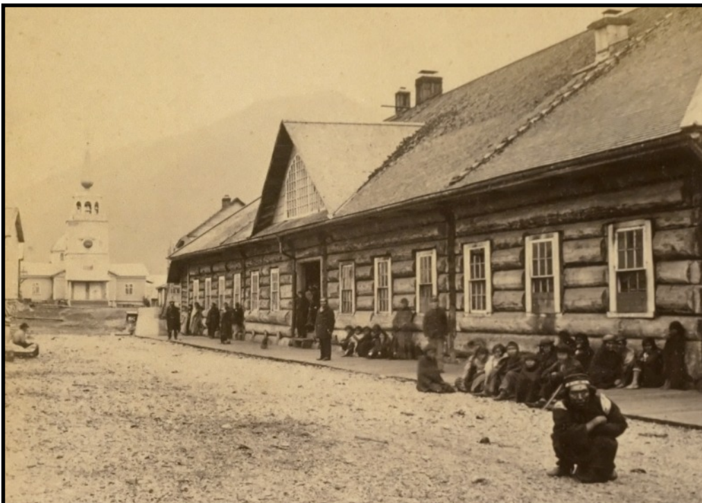
Sitkans along Lincoln Street with the Russian Orthodox Church in the background, 1868.