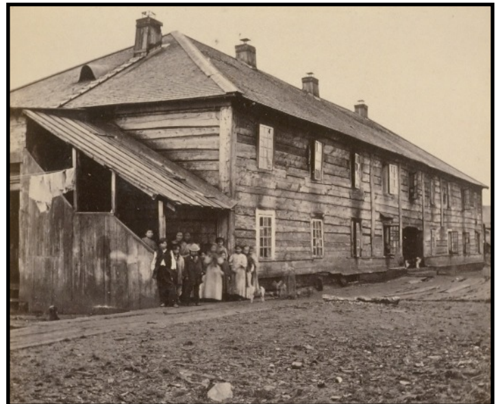
The building known as the Double Decker, 1868.

If the Russian colonies had not been sold it would be necessary to live in one of the states for five years in order to receive citizenship. Yet here no more than ten minutes are needed for this. All you have to do is bring two witnesses to the proper office, who will there swear that so-and-so really was in this country at the changing of the flags, and that they consider him to be a reputable person. Then the person must under oath renounce allegiance to all other states in the world, particularly Russia, and promise with all his powers to support the constitution of the United States by oath. He concludes by raising his right hand and saying "I swear." Then they give their signatures, and the matter is finished. Thus have several of the Russians here become Americans.