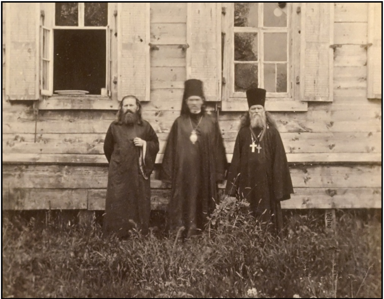
The photographer Eadweard Muybridge (using the alias "Helios") arrived in Sitka in 1868, ten months after the transfer ceremony, and took photographs on contract for the United States government. This image of Russian Orthodox priests was taken outside what is today called the Russian Bishop's House.